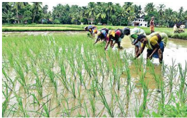
File pic of paddy cultivation

"Landslides are not the reason for reduction in cultivation of paddy. The prime reason for decrease in paddy cultivation is due to increasing human-animal conflict across the district. Farmlands have been abandoned in Siddapura, Kutta, Thithimathi and other villages due to increasing conflicts with wildlife. Not just crops but numerous farming equipments were also damaged by elephants and many villages across South Kodagu witnessed 100 per cent crop loss due to attack from wild boars. These conflicts