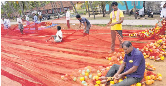
Traditional boat fishermen stitch fishing nets near Malpe, Udupi district | Express