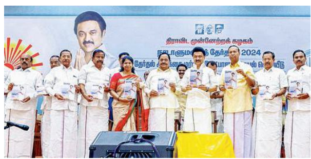
Making a pitch: Chief Minister and DMK president M.K. Stalin and other leaders releasing the party's manifesto and list of candidates in Chennai on Wednesday.