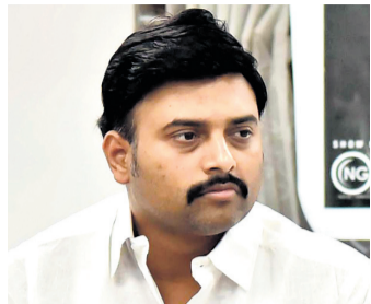
Forest minister M Mathiventhana

minister is staying in such a resort even though the forest department owns several guest