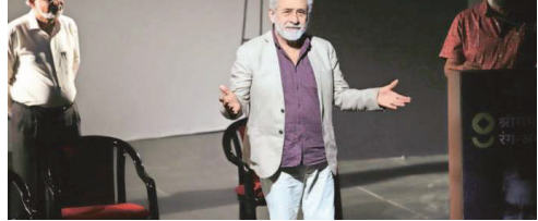
Actor Naseeruddin Shah at the inauguration of the 'Shreeram Lagoo Rang - Avakash' in Pune on Thursday.