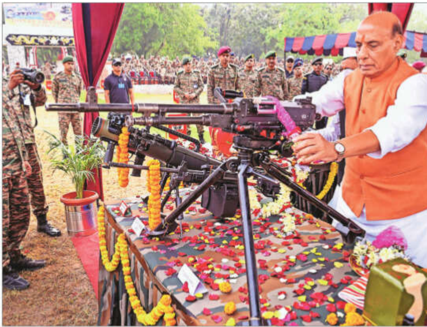
Defence minister Rajnath Singh performs Shastra Puja on the occasion of Vijaydashami during a function at 33 Corps Headquarters, in Darjeeling (West Bengal) on Saturday

Vijaydashami marks the end of Navratri and is cele-