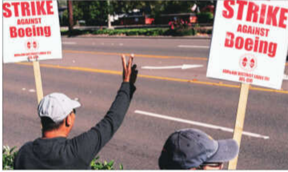
The cuts translate to roughly 17,000 positions and will include executives, managers and employees

The company also plans to delay the introduction of its first 777X jetliner, and separately announced that it expects third-quarter sales to come in well below Wall Street estimates.