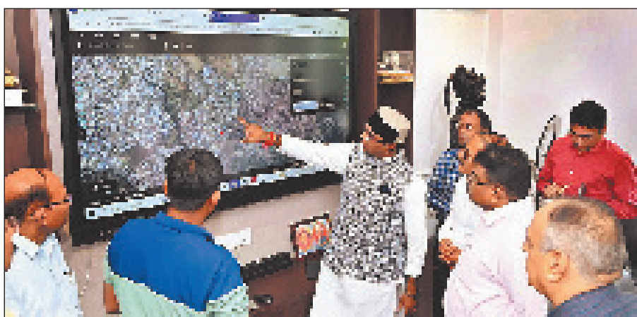
About three lakh people will benefit

The above information was given by Cooperation Minister Vishwas Kailash Sarang in a meeting held on Monday in Narela Assembly regarding the construction of Chhola flyover under Khedapati Hanuman Corridor of Bhopal. He instructed the PWD officials to prepare a detailed action plan and start the construction work of the flyover soon.