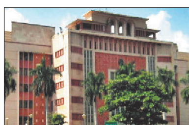
Administrative Correspondent, Bhopal

The state government has transferred 20 officers of the State Administrative Service.