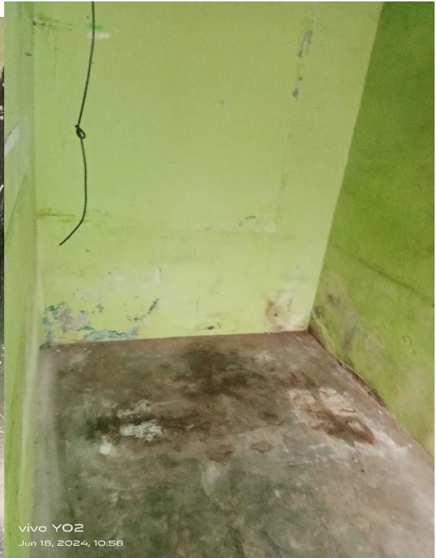
vivo Y02 Jun 18, 2024, 10:58