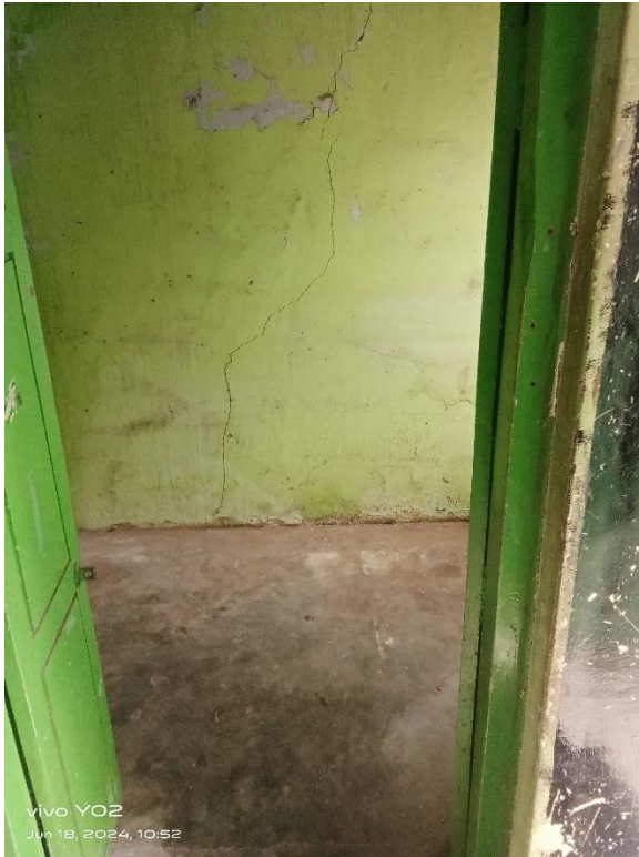
vivo Y02 Jun 18, 2024, 10:52