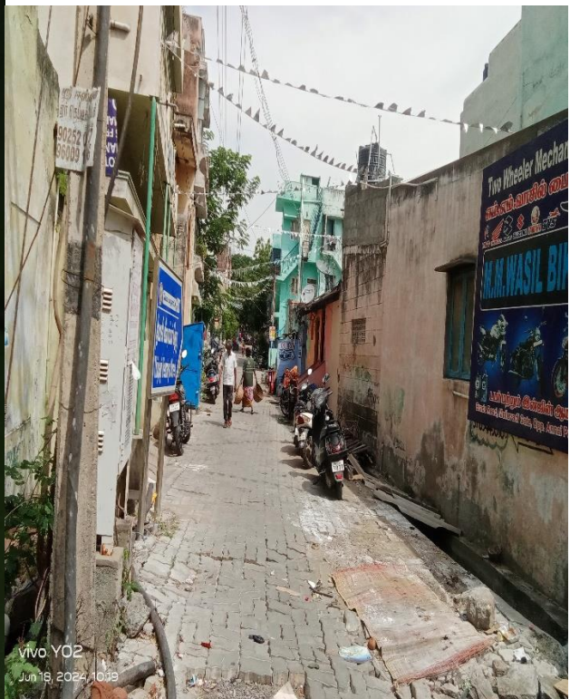
vivo Y02 Jun 18, 2024, 10:59