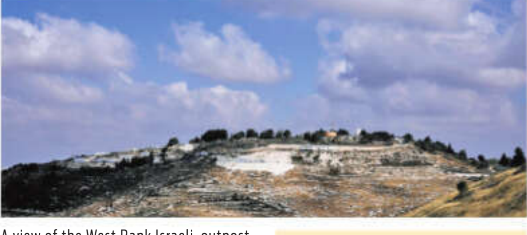
A view of the West Bank Israeli outpost of Homesh

Israel captured the West Bank, along with Gaza and east Jerusalem, in the 1967 Mideast war and the Palestinians want all three territories for their future state. Most of the international community views settlements as illegal and an obstacle to resolving the decades-old conflict. Defense Minister Israel Katz said the settlement decision "strengthens our hold on Judea and Samaria," using the biblical term for the West Bank. He said it "anchors our historical right in the Land of Israel, and constitutes a crushing response to Palestinian terrorism." He added that the construction of settlements was also "a strategic move that prevents the establishment of a Palestinian state that would endanger Israel." Western ally Jordan also condemned the move as illegal, and said it "under-