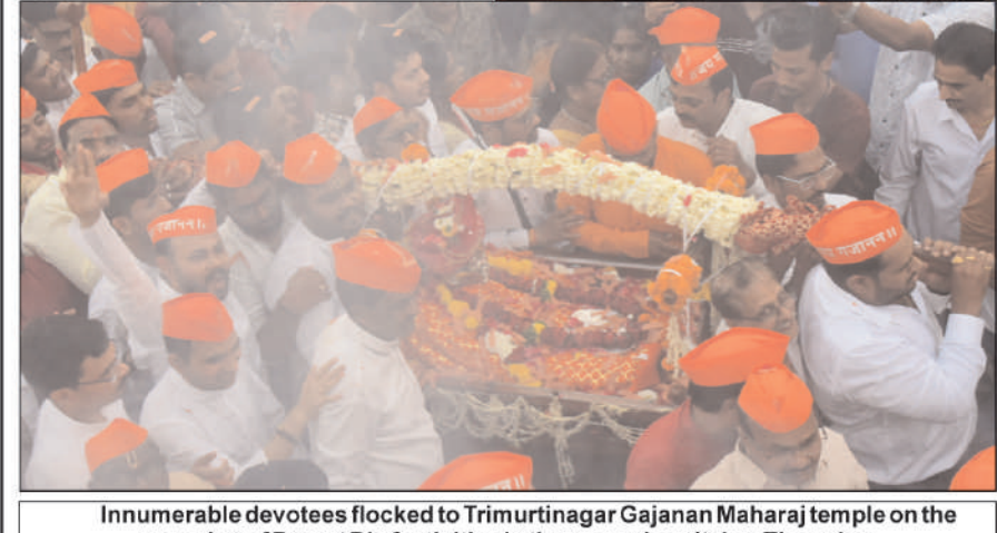
Innumerable devotees flocked to Trimurtinagar Gajanan Maharaj temple on the occasion of Pragat Din festivities in the second capital on Thursday.