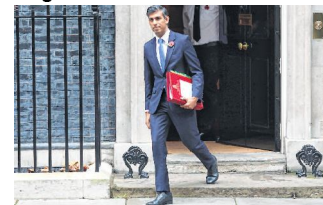
Britain's Prime Minister Rishi Sunak carries his red ministerial folder as he leaves 10 Downing Street on Wednesday

Labour's climate change secretary Ed Miliband said: "The Prime Minister has been adamant into going to Cop27 for the reason of belief that he would fail to turn up. He is going to avoid embarrassment, not to provide leadership."