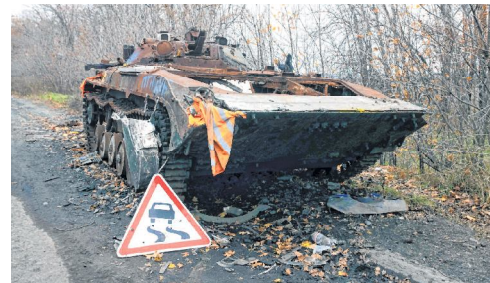
A road sign lies next to a damaged Russian armored personnel carrier on a road near Vovchans'k, Kharkiv region on Tuesday

Kyiv: Diplomatic efforts salvaged a wartime agreement that allowed Ukrainian grain and other commodities to reach world markets, with Russia saying on Wednesday it would stick to the deal after Ukraine pledged not to use a designated Black Sea corridor to attack Russian forces. The Russian Defence Ministry said in a statement that Ukraine formally committed to use the established safe shipping corridor between southern Ukraine and Turkey "exclusively in accordance with the stipulations" of the agreement.