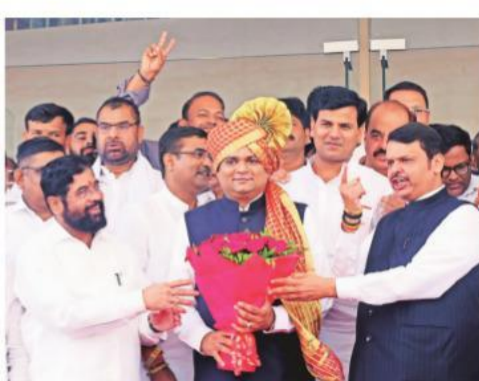
Newly elected Speaker Rahul Narwekar is flanked by Eknath Shinde and Devendra Fadnavis.