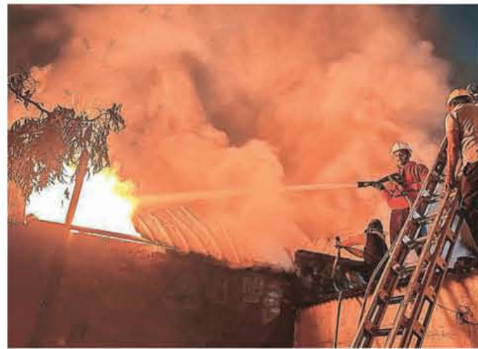
Firefighters dousing fire that broke out at a gloves manufacturing factory in Chhatrapati Sambhajnagar dist, Sunday morning.

AT LEAST six persons died after a massive fire broke out at a gloves-manufacturing factory in Maharashtra's Chhatrapati Sambhajnagar district, formerly Aurangabad, early Sunday. According to fire brigade officials, the fire broke out at around 2:20 am at the Sunshine Enterprises factory located in Waluj MIDC area. "Around 15 workers were sleeping inside when the fire broke out. So far, we have recovered the bodies of six workers. Other workers managed to escape but the six were trapped. We are conducting an investigation to find out the exact cause of the fire," a fire brigade official told The Indian Express.